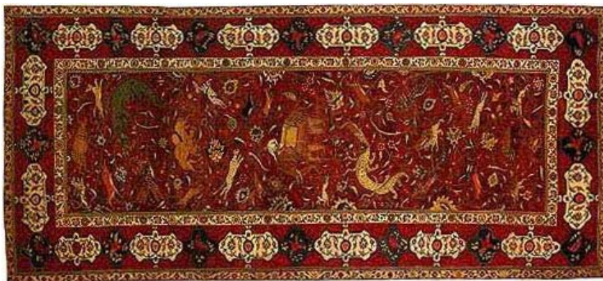
The Widener Animal Carpet Mughal era, ca. 1590 National Gallery of Art, Washington, DC

Textiles of Klimt's Vienna , recently on view at The Textile Museum.