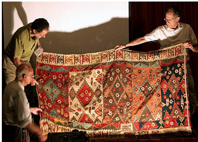
Top: long tent of Kurdish tribal leader